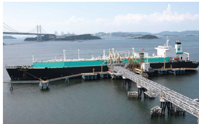
LNG importing facility (Sakaide LNG Company)