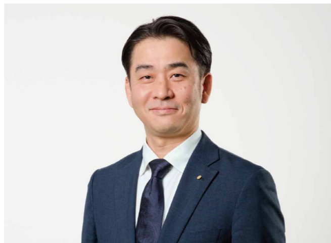
Representative Director, President and CEO

TB Global Technologies is working to achieve the SDGs.