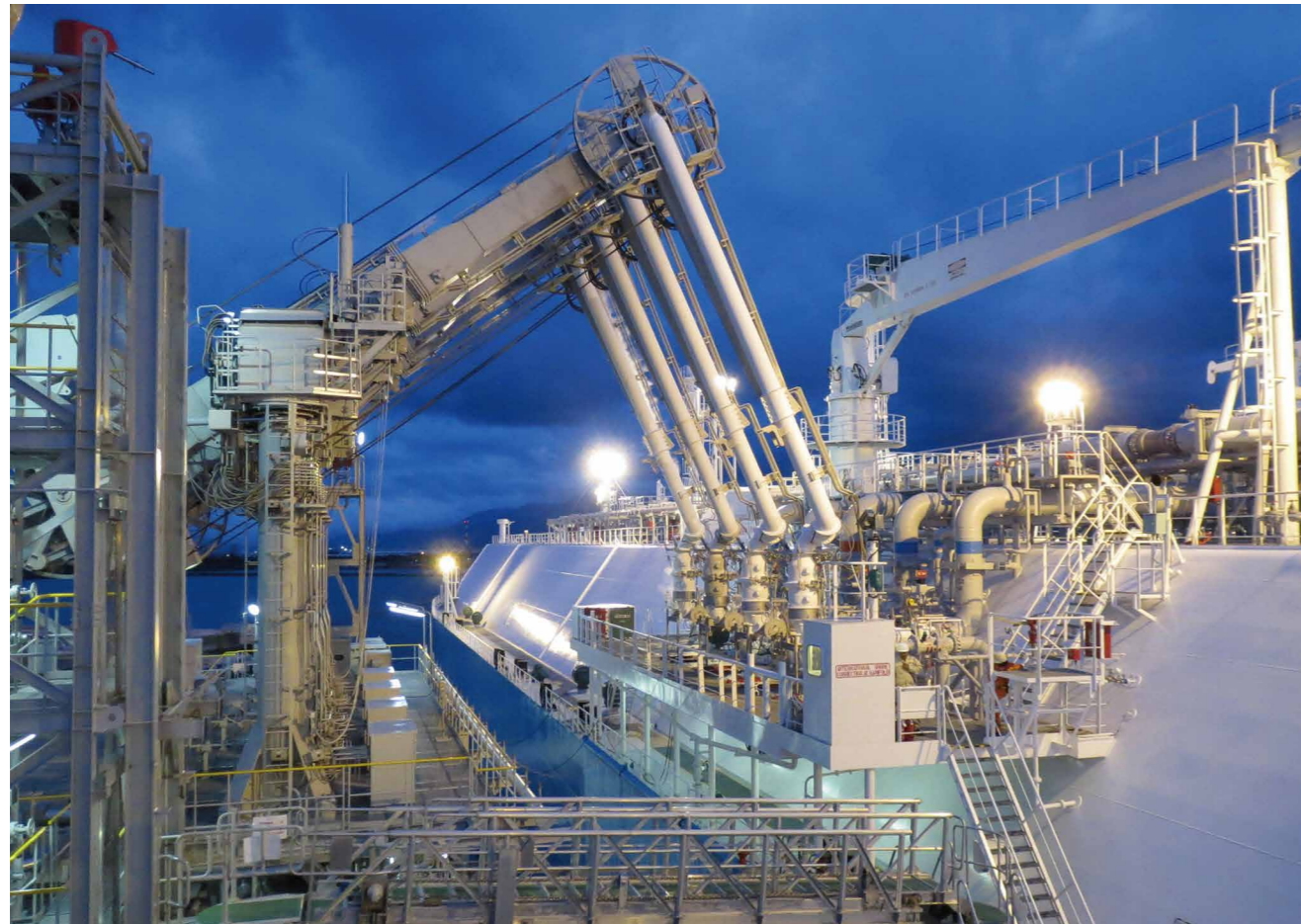
LNG facility at Naoetsu (Inpex Corporation)

With "Safety," "Reliability," and "Promptness" as our keywords, we will contribute to improving the business value of our customers.